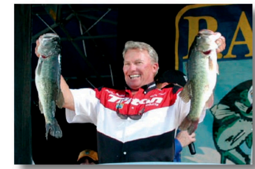
Please Release Me is used and endorsed by Roland Martin